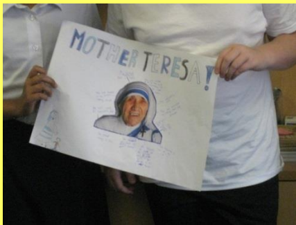
Researching and learning about leaders of faith.