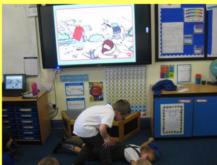
Role Play & Drama