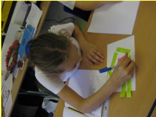
Writing the Lord's prayer